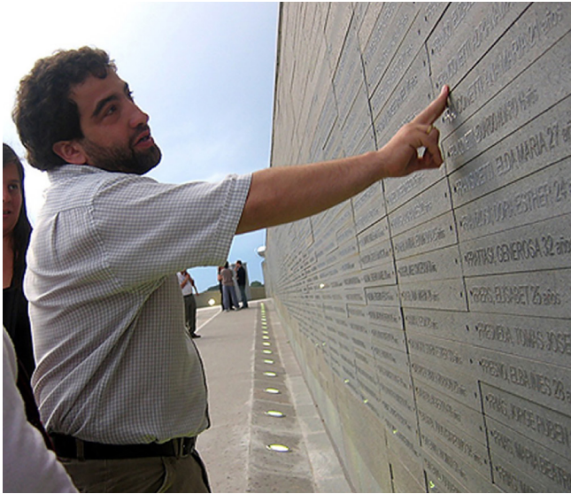
Figure 1: Parque de la Memoria - Buenos Aires.