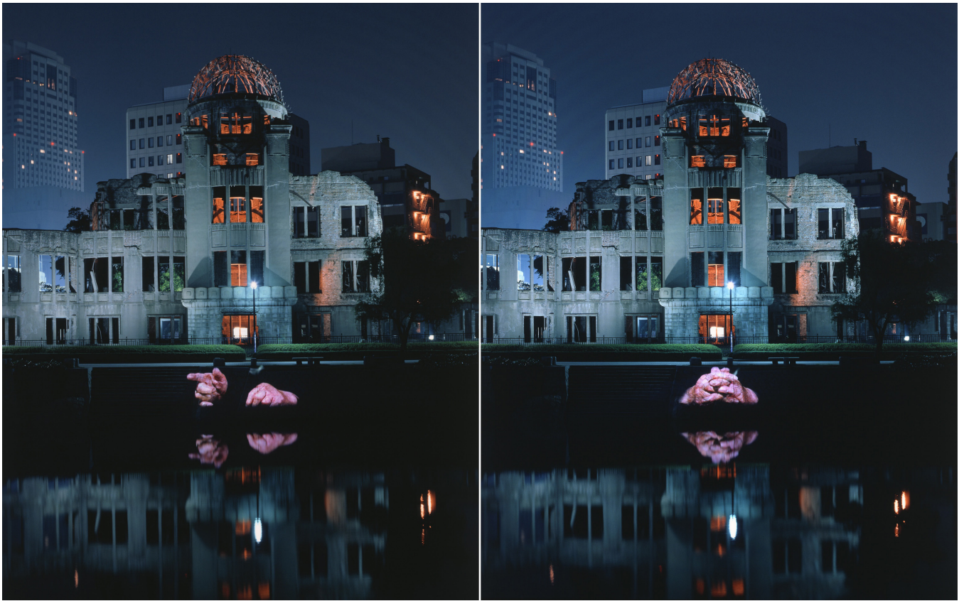
Figure 2: Hiroshima Projections – Krzysztof Wodiczko.

According to Hanna Arendt 10 , political equality means visibility; conversely, political inequality and invisibility go hand in hand. So, to a significant extent, the success of democracy and indeed of democratic public space can, and perhaps should be measured by its capacity to encourage and assist in the process disruption of the continuity of the history of the victors (and of the cities' symbolic narrative) by the tradition and memory of the vanquished and the nameless through political, cultural, spatial, and yes, architectural and artistic means . 11 In this sense, we, as teachers, artists and architects who want to deepen and extend the public sphere have a twofold task: creating works that, one, help those who have been rendered invisible to “make their appearance explicitly” and, two, develop the viewers' capacity for public life by asking them to respond to, rather than react against, that appearance.” My design partner (Wodiczko + Bonder) Krzysztof Wodiczko's Hiroshima Projections, for instance, transformed the remains of the Hiroshima A-Bomb site, into a ‘speaking and declaring monument’. Survivor's proactively declare in public and through their projected testimonies ‘demand’ from viewers to find ways to respond in and to the present. 11 (figure 2)